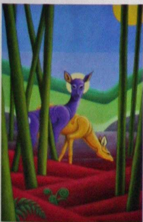
from top clockwise: Emerald, 28in x 36in, Oil on Canvas.